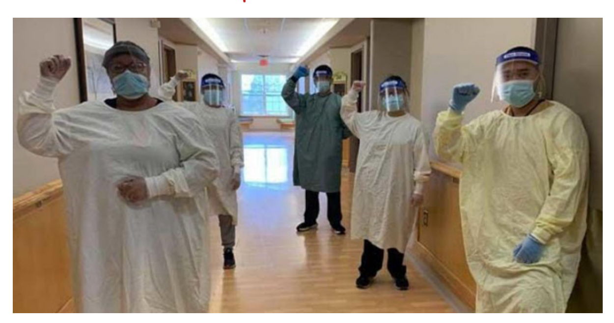
With Omicron spreading across Canada and disrupting lives, Unifor's COVID-19 resources can help.